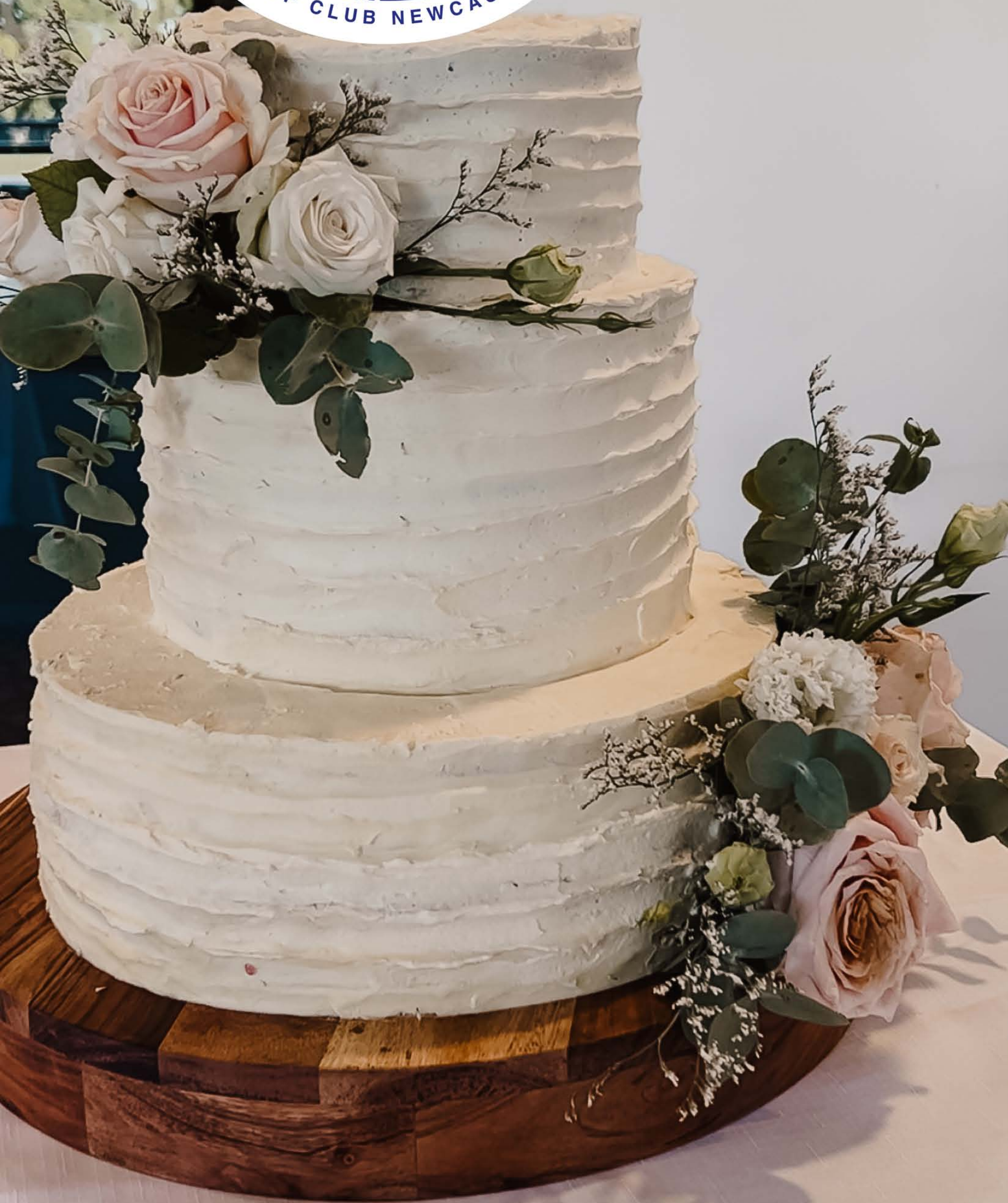
Shortland Waters Golf Course